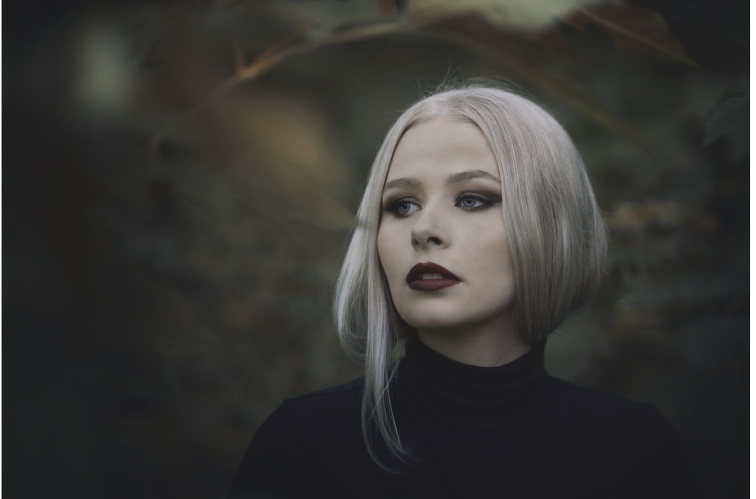
Model / MUA : Larissa Westerhuis