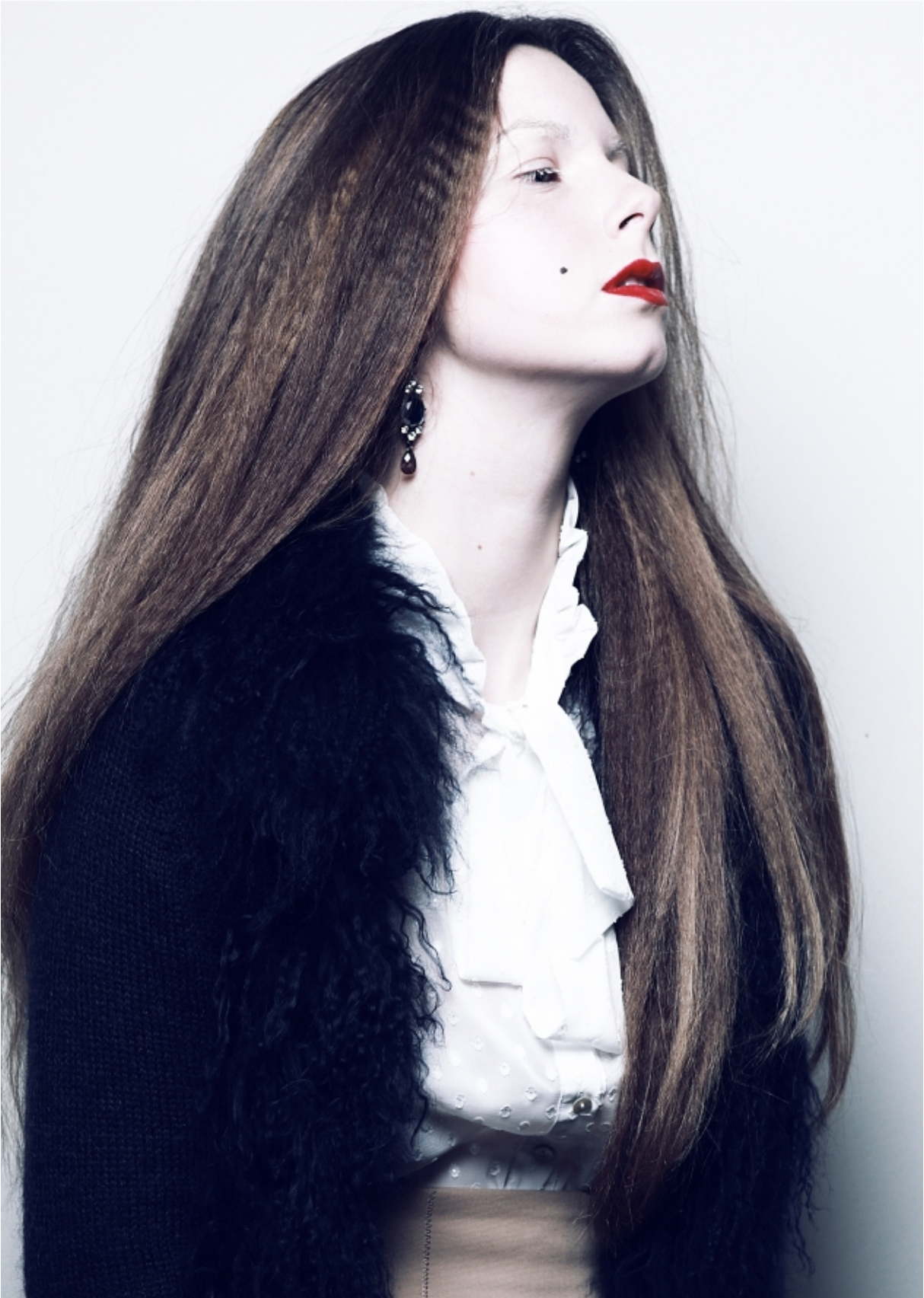
model jaquemijn de man