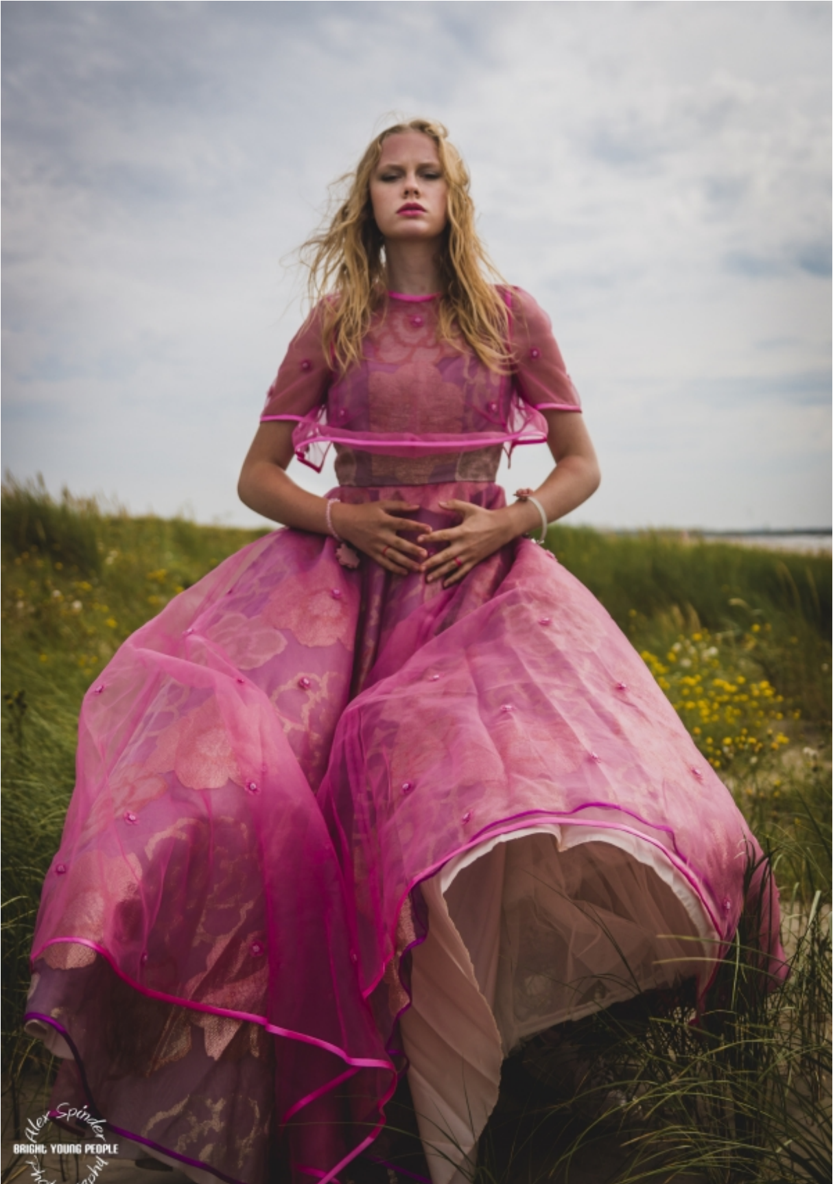
Model: Leona Dekker Agency: A&P Modelmanagement - Dress: Judith Veldkamp Couture MUAH: Nona Ibu